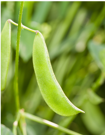
Lima Bean Plant