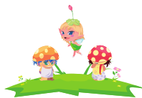
Fairy or peg people